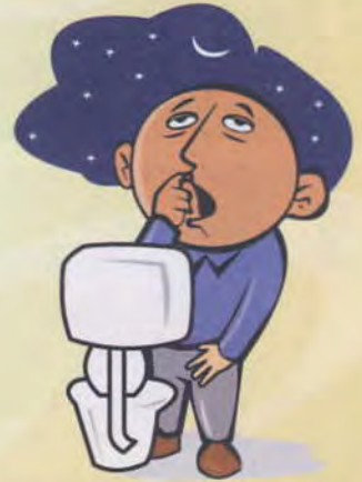
Often waking up to urinate 夜里多次醒来排尿 Kerap bangun pada waktu malam untuk kencing