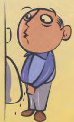
Weak urine stream 尿流无力 Pengaliran air kencing yang lemah