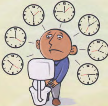
Frequent toilet visits 经常得上厕所 Kerap ke tandas untuk kencing