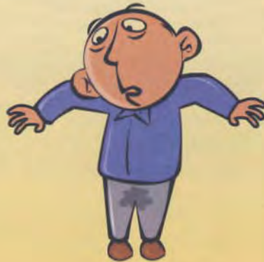
Terminal dribbling or incontinence 残尿滴流或尿失禁 Terdapat sisa air kencing selepas kencing