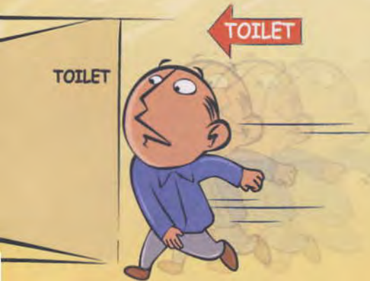
Urgency to urinate 尿急 Tiba-tiba berasa ingin kencing